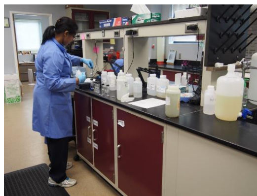
JCUA Laboratory Staff Conducting Sample Testing and Data Analysis

1225 Jackson Avenue, Pascagoula, Mississippi 39567