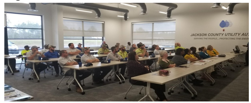
Thank you to Fluid Process & Pumps, LLC & Sheppard Electric for hosting and providing two lunch and learns to the employees of the JCUA.