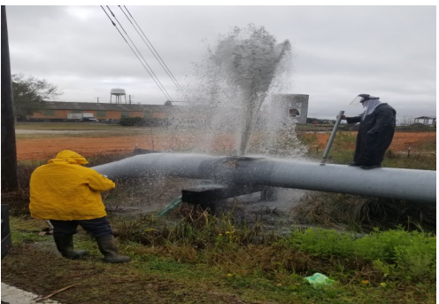
Chris Smith and Gage Allen of the Maintenance department repairing the force main at the PMP plant located on the river road bridge crossing.