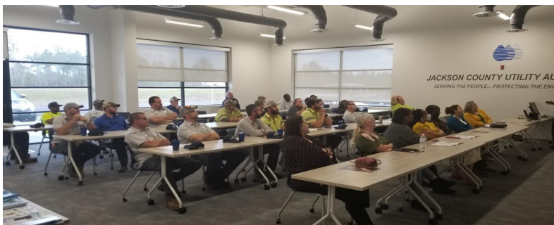
Thank you to Fluid Process & Pumps, LLC & Sheppard Electric for hosting and providing two lunch and learns to the employees of the JCUA.